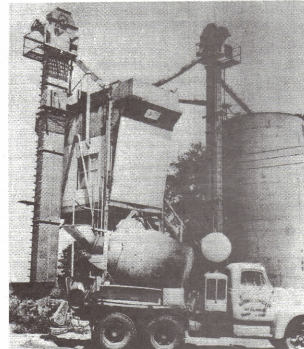
MODERN REDI-MIX PLANT is one of the newer features of the service offered our patrons.